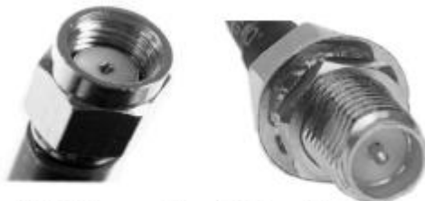
SMA Connectors (Male - Female)

Connectors are industrial standard component, below are selectable: