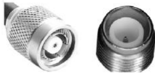
TNC Connectors (Male & Female)